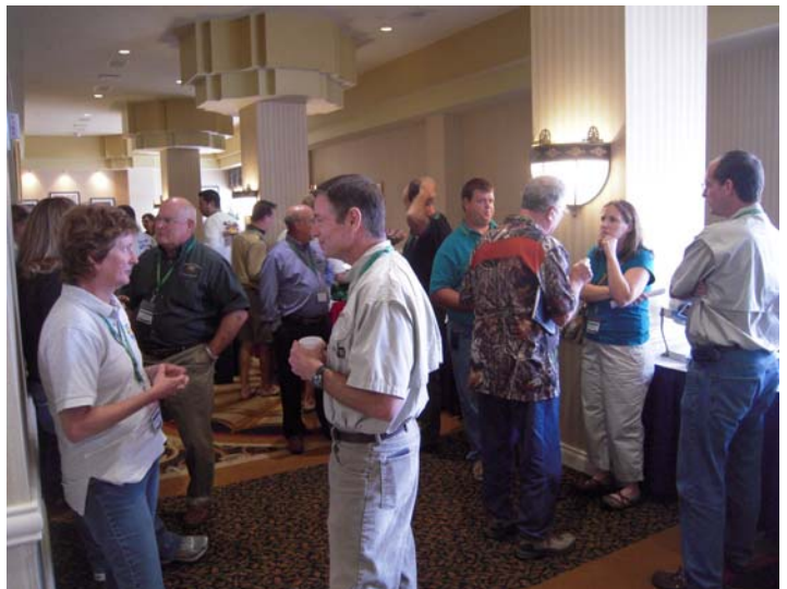
Good time was had by all!!!

UW-F, with the help of the FWC, conducted this event FREE to all participants. There were no fees for attending and both meals were FREE. UW-F has a tradition of presenting events at no charge for those attending. Obviously, there were costs involved and the event could not have been held without the assistance of a number of generous donors. A special THANK YOU to each of those who contributed.